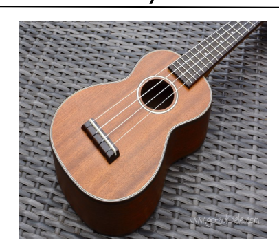
JOIN A CLASS-New sessions beginning soon